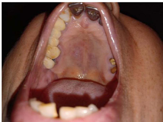
Figure 2 Follow-up examination showing significant improvement and healing of the oral herpes zoster lesions following treatment.