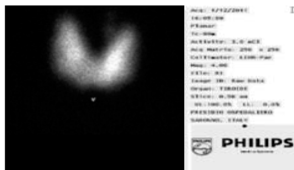
Figure 2 Thyroid scan (technetium-99m pertechnetate imaging) patient under treatment (75 µg replacement levothyroxine therapy).

Graves' disease is the result of a complex and abnormal immune response involving TSHR, TSHR-specific T cells,