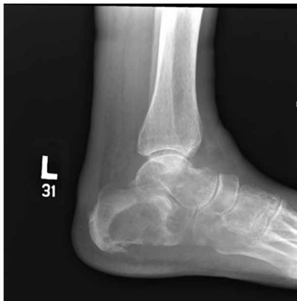
Figure 1 Radiograph of the left foot, demonstrating a large lytic lesion and destruction of the calcaneus, the cuboid, and the fifth metatarsal.

In November 2010, an 82-year-old Caucasian female presented at the orthopedic clinic at the University of Nebraska Medical Center (UNMC) with a 3-month history of left heel pain, for which she had been treated by a primary care physician with anti-inflammatories, without relief. She had no history of local injury or trauma; she also denied any hematuria. Her medical and family histories were significant for hypertension. Otherwise, she had been in good health and highly functional for her age. An X-ray of her left foot displayed radiolucency of the calcaneus (Figure 1). She was then evaluated by an orthopedic surgeon, and an orthopedic controlled ankle motion (CAM) boot and pain medications were prescribed for symptomatic treatment. A magnetic resonance imaging (MRI) revealed a left calcaneal lesion, and metastatic disease was suspected. A biopsy of the calcaneal lesion revealed metastatic urothelial-cell carcinoma with squamous differentiation (Figure 2). Further workup, including a computed tomography (CT) scan of the abdomen and pelvis, showed left hydronephrosis and an obstructive mass in the left ureter, at the iliac crossing (Figure 3). A technetium-99m bone scan revealed increased radioactive uptake in the left calcaneus (Figure 4).