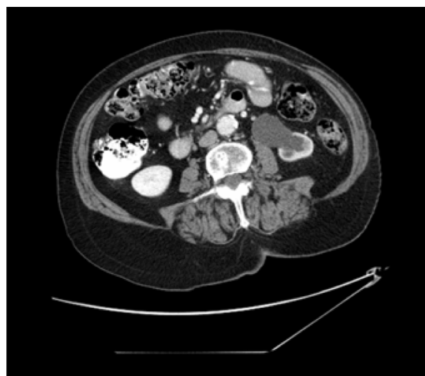
Figure 3 Abdominal and pelvic CT scan revealing a left hydronephrosis with renal cortical atrophy and an obstructing mass at the iliac crossing of the left ureter.

In July 2011, the patient presented to her medical oncologist with new onset of dysuria and painful vaginal discharge.