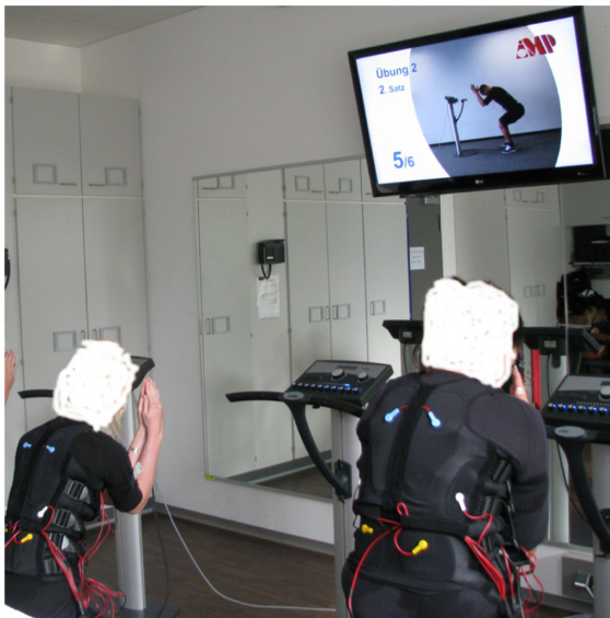
Figure 3 Whole-body electromyostimulation exercise protocol.

slight movements, with low amplitude performed without any additional weights in a standing position (Figure 3). Amplitude, velocity, and corresponding intensity generated by the movement was set low (ie, squat: leg-flexion <35^\circ ) to prevent effects from the exercise per se. 14 Core exercise/movements performed were: “quarter” (leg flexion <35^\circ ) squat (6 seconds down) with arm extension/“quarter” (leg flexion <35^\circ ) deadlift (6 seconds up) with arm flexion; “quarter” squat (6 seconds down) with trunk flexion (crunches); “quarter” squat (6 seconds down) with lat pulleys/“quarter” squat (6 seconds up) with military press; “quarter” squat (6 seconds down), crunch with butterfly/“quarter” squat (6 seconds up) and reverse fly; “quarter” squat (6 seconds down) and vertical chest press/“quarter” squat (6 seconds up) and vertical rowing. The core exercises listed above were combined and slightly modified (eg, twisted crunch) to generate ten different types of slight movements/exercises; however, there was no progressive incrementing of intensity with respect to the movements during the interventional period. Thus, all in all, the WB-EMS session consisted of 10–14 dynamic exercises, structured in 1–2 sets of eight repetitions.