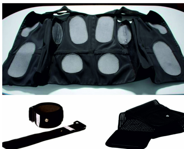
Figure 2 Whole-body electromyostimulation electrodes (vest and sleeves).