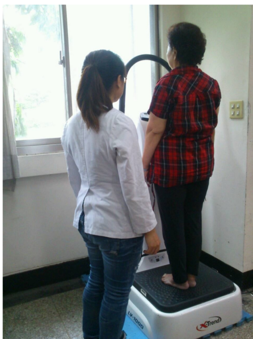
Figure 2 The subject stood on the platform in a natural full standing posture and was monitored by a well-trained physical therapist during whole body vibration.

Abbreviations: n, number; BMD, bone mineral density.