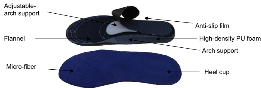
Figure 1 The heel cup was made up of a high-density polyurethane (PU) customized insole with an arch support insole for the participants. The adjustable sandwich insole is constructed with super-thin Velcro. It is a single modularized custom-made insole with adjustable inserts. The microfiber or natural leather layer is wear-resistant and moisture wicking, which keeps feet dry and comfortable. The high-density breathable PU layer is designed for long-term use without deformation and protects the foot by dampening shocks.

reliable balance index can be easily obtained; thus, the system was suitable for large sampling measurements and balance evaluation in specific people.