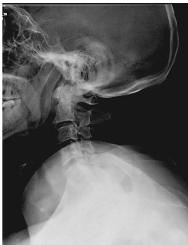
Figure 6 Postoperative lateral radiograph of cervical spine showing the anatomically normal structure of prevertebral tissues.

and grow across the disc space. 2,3 In most textbooks, DISH is described as “asymptomatic”, and it is often accidentally found by radiographs of the spine performed for restriction in movement of spinal joints and entheses-related pain. 4,5 Whether the condition itself is a cause of significant pain and whether it is a true disease entity still remain controversial. 6