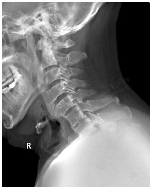
Figure 1 The lateral radiograph of cervical spine shows characteristic flowing ossification along the anterior aspect of the cervical vertebrae from C2–C5.

Laboratory tests including blood cell count, C-reactive protein, erythrocyte sedimentation rate, and autoimmune panel were normal. The lateral radiograph of his cervical spine showed characteristic flowing ossification along the anterior aspect of the cervical vertebrae from C2–C5, with relative preservation of the disc spaces (Figure 1). The facet joints