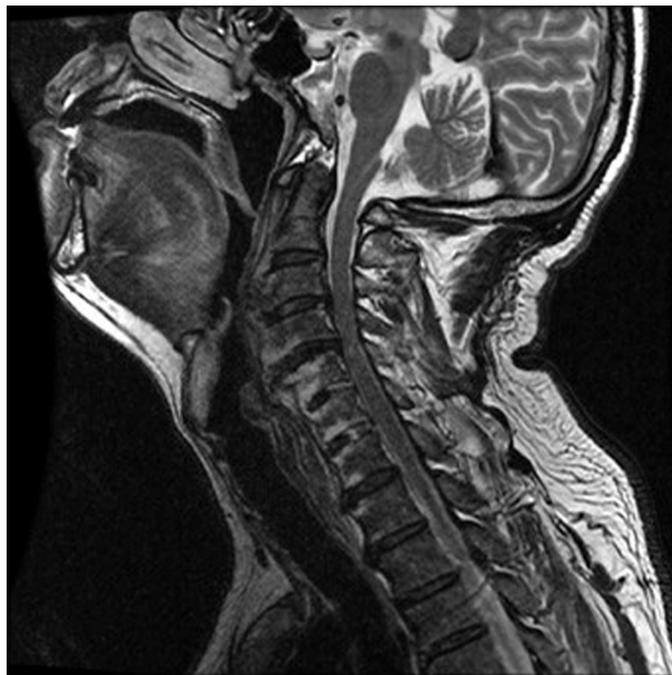
Figure 4 The preoperative T2-weighted sagittal magnetic resonance spin-echo image shows high signal intensity of bone marrow in C5–C7 as well as in the outgrowth hyperostosis.

bone in the fibrous tissue with spindle cell proliferation was noted. Primitive cartilage and immature woven bone could also be seen. The resected sample also showed nonspecific diffuse chronic inflammation in the trabecular bone and connective tissue infiltrated with a mixed population of lymphocytes, plasma cells, and macrophages (Figure 5). However,