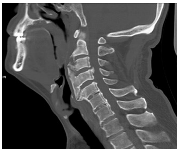
Figure 2 The preoperative CT scan of the cervical spine reveals continuous but irregular flowing hyperostosis alongside the anterior aspect of the whole cervical vertebrae.

Conservative therapy was insufficient for this patient, therefore, we performed osteophyctomy. Difficult intubation was anticipated in view of the radiological findings and restricted mobility of the neck. We discussed anesthetic choices and intubating techniques with the anesthetist preoperatively. The patient was placed under general anesthesia with extreme caution to not over rotate or extend his neck. He underwent operative excision of the anterior osteophytes through routine anterolateral approach to the cervical spine. On histologic examination, the appearance of trabecular