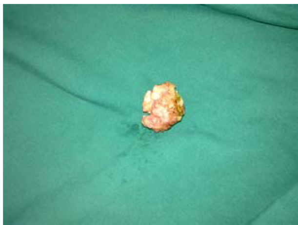
Figure 1 Surgical specimen of paraganglioma of vagina.

Paraganglioma is a rare soft-tissue neuroendocrine tumor, and can be classified as pheochromocytoma and extra-adrenal paraganglioma depending on its pathogenic site. The latter is closely related to tumors in the extra-adrenal sympathetic and parasympathetic paraganglioma, and named after the anatomic site as well as its functional activity. 6 Paragangliomas have rarely been reported in the female genital tract, including