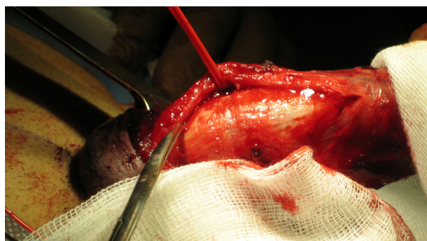
Figure 1 Preparation of the dorsal neurovascular bundle.

Partial return of erection without sexual arousal occurred on two occasions during the 10-day hospitalization, but was managed by manipulation of the penis, ie, by milking the tumescence into the shunt. After 3-months follow-up, the shunt was still palpable as a subcutaneous swelling.