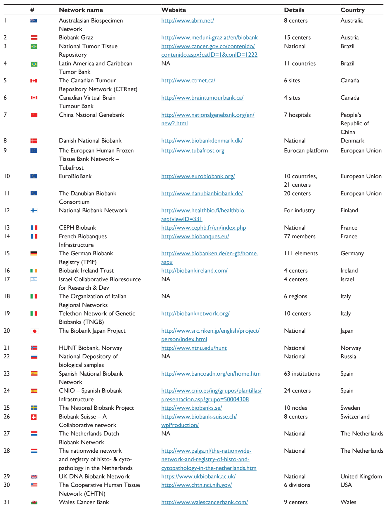
Table 2 Biobank networks worldwide