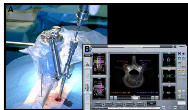
Figure 3 (A and B) Intraoperative setup of the Renaissance miniature robot (Mazor Robotics, Caesarea, Israel).

Navigation-based techniques have been shown to increase the accuracy rate in pedicle-screw placement, 24,25 even in the case of pediatric spine surgery. 26 In the review cited earlier, Gelalis et al 9 found that CT- and fluoroscopy-based navigation increased the accuracy rate of implants to 89%–100% and 89%–92%, respectively. Tian et al found likewise in their review summarizing 43 studies a significantly increased accuracy rate of navigated pedicle screws. 27 In contrast to Gelalis et al, they found 3-D fluoroscopy-based navigation to be slightly more accurate than CT or 2-D fluoroscopy-based navigation, 27 while Mason et al found 3-D fluoroscopy-based navigation to be significantly more accurate than 2-D fluoroscopy-based navigation or conventional fluoroscopy. 28 Studies furthermore showed that the application of navigation