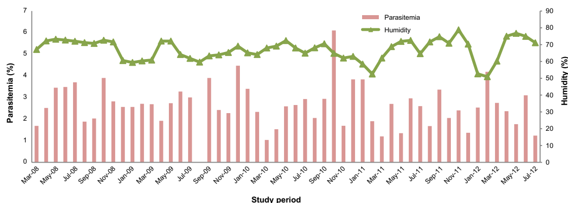
Figure 2 Humidity and parasitemia between March 2008 and July 2012.

Rainfall and temperature showed no correlation with parasitemia. Shanks et al reported that, although temperature is useful in vector longevity, parasite development in vector and transmission to humans; it does not correlate with parasitemia or clinical symptoms of malaria. 61 It has also been established that although precipitation modulates