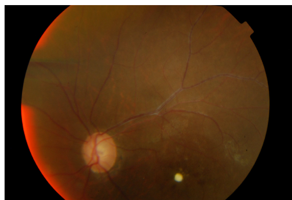
Figure 2 Twelve months postoperatively, the full-thickness macular hole was closed successfully and the retina remained attached. Note: There are residual triamcinolone crystals at the macular hole.

Because of the low incidence of this condition, the pathogenesis of a uveitic macular hole in the absence of associated epiretinal membrane formation and the most appropriate