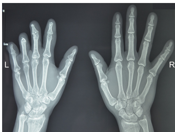
Figure 2 Male patient, 21 years old, with degloving damage involving four digits caused by machine-related trauma.

We used an embedded graft that included combined abdominal skin flaps, dorsalis pedis flaps, toe flaps, and toe-web flaps, which were naturally integrated. Abdominal skin flaps are elastic and soft, whereas foot-derived flaps are low in fatty tissues and do not roll or slide after healing with deep tissues, permitting good holding capacity in the grafted fingers. The two types of flaps integrated well, and resulted in satisfactory firmness and softness. The donor area of the abdominal skin flap was large and wide, providing enough capacity to cover the injured area on the hand. In the present study, the degloved fingers were embedded into the superficial layer of the skin fascia and laterally stabilized by abdominal tendons via the skin. This allowed one-time repair of most of the circumferential injuries of the hands. The abdominal thin skin flap was used mainly on the finger back and side, which have no critical function, and the dorsalis pedis flap, dorsal toe flap, and toe-web flaps, which were of good quality with good blood circulation and resulted in rapid return of skin sensation, were used to cover the finger-flexor side. Therefore, covering the common injured regions and reconstructing the key functions were effectively combined, so that flap resources were fully utilized. We followed our cases for 1 year, and found that sensation recovery in the palm