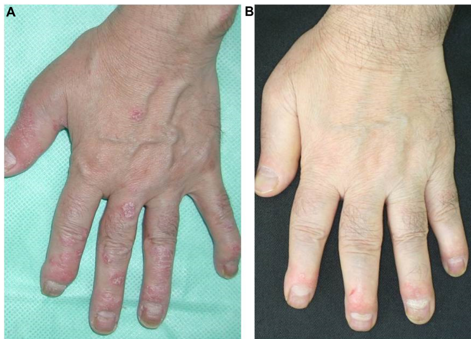
Figure 2 Progression of dactylitis.

It is quite important to detect PsA early because joint damage occurs and progresses in the early course of the disease. The “early” stage of PsA is usually used for patients with a duration of less than 2 years. 32,33 Dermatologists are uniquely poised to suspect PsA, which may lead to its early diagnosis, because cutaneous lesions precede the onset of joint pain in nearly 70% of patients. However, dermatologists may easily overlook PsA because, in general, little attention is paid to