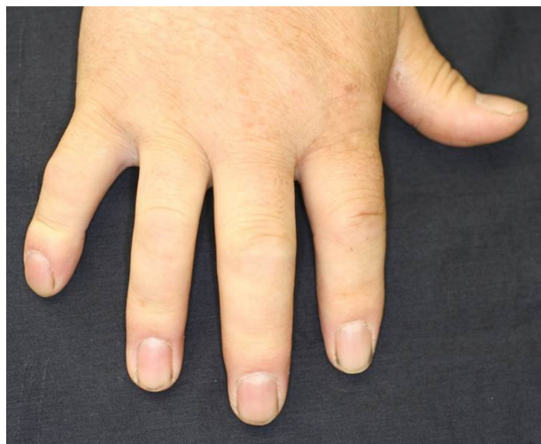
Figure 1 Dactylitis of the second and third fingers.

Moreover, dactylitis is frequently seen in spondyloarthritis other than PsA, and 59 patients (21.5%) suffered from dactylitis among 275 spondyloarthritis patients. 29 In the studies, toes were more frequently involved than fingers (78% vs 42%) in dactylitis, and the second digit was the most frequent. The digital swelling was an inaugural symptom in 10% (5/49) in PsA, and more than half of the patients with dactylitis had the first episode of dactylitis before the diagnosis of spondyloarthritis. 29 Dactylitis progresses in association with disease severity (Figure 2), even if treated with nonsteroidal