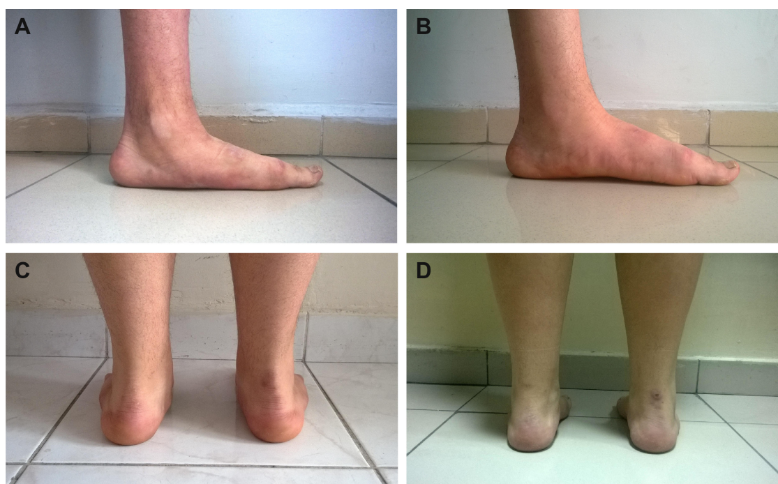
Figure 2 Preoperative and postoperative images of the patients in standing foot posture. Notes: Change from baseline in (A, B) the foot arch in a patient, and (C, D) heel valgus in another patient.

removal, if required. 4,15 Complete and painless range of motion of the subtalar joint can also be achieved after implant removal. 15