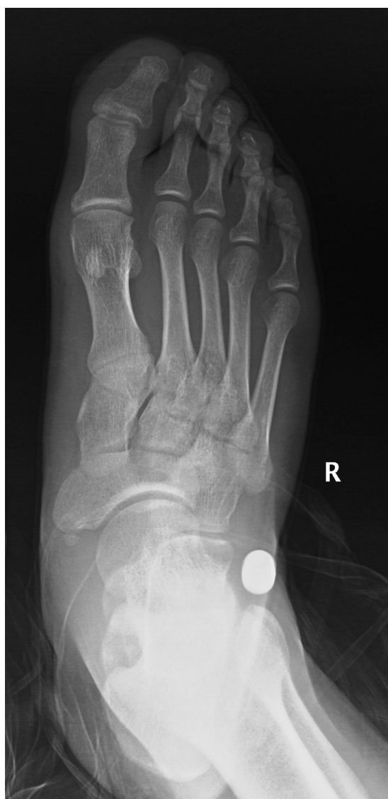
Figure 3 Anteroposterior X-ray showing fixation failure of the subtalar implant at 7 months postoperatively.