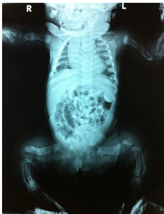
Figure 2 OI type III, 2-month-old baby girl.

in Israeli Bedouin and Saudi families from the Arabian Peninsula. 30,31 Affected individuals had bone involvement of variable severity with decreased BMD, multiple fractures ranging from prenatal onset up to 6 years of age, white or