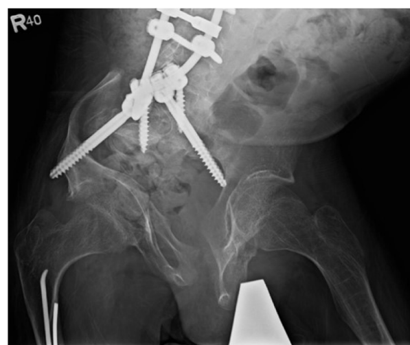
Figure 3 Male, 15-years-old, OI type XI (Bruck syndrome – FKBP10 mutation).

Abbreviations: OI, osteogenesis imperfecta; R, right; L, left.