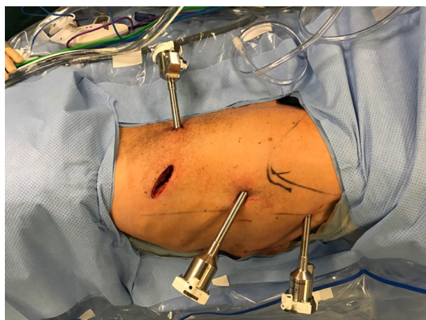
Figure 3 Chest phase port placement with extraction incision.

The patient is placed in a lateral decubitus position and the right thorax is entered through the sixth intercostal space, where an 8 mm port (10 mm port for SI system) is inserted for the robotic camera. A robotic port is then placed in the third intercostal space for robotic arm number 4 (XI system, arm 1 for SI system). A 4 cm incision is made at the ninth intercostal space, which serves as the access for the assistant (Figures 3, 4). An 8 mm robotic port is placed at the tenth posterior intercostal space for an additional robotic arm. The pleura over the azygos vein is incised and mobilized