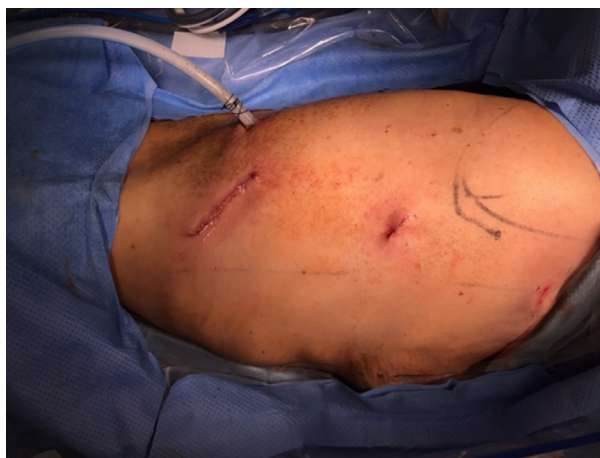
Figure 4 Chest phase port placement with chest tube.

completely with the hook cautery. The vein is transected with a vascular stapler. The esophagus is mobilized en bloc down to the gastroesophageal junction dissecting all visible lymph nodes in the periesophageal area, periaortic area, inferior pulmonary ligament, and subcarinal nodal basins. The specimen is then removed and checked for margin status. The esophagogastric anastomosis is created using a 25 mm anvil passed transorally (Orvil, Autosuture, Norwalk, CT, USA). After a nasogastric tube is brought down proximal to the newly created anastomosis, the chest is filled with saline and 40 mL of air is instilled into the proximal esophagus to check for anastomotic leaks. An omental patch is finally secured around the anastomosis.