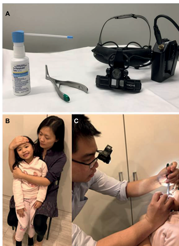
Figure 2 (A) From left to right: Co-phenylcaine™ Forte Spray, Killian nasal speculum and head light. (B) Correct way of cuddling child when removing NFBs. (C) Medical personnel's hands resting on the child's face while attempting removal of NFBs.

However, if the examination confirmed the presence of a NFB, now choose the instrument for NFB removal. Over the last 2–3 years, I have mainly used a metallic ring curette to remove NFBs. I find it very safe, and it can be used to remove the NFBs quickly without causing much trauma to the nasal cavity. I find the metallic ring curettes to be far superior and versatile than the disposable plastic curettes, as the plastic curettes are too thick and obscure the view and are also quite malleable and not as rigid as the metal ones. Other instruments such as suction and forceps take more time to make the correct positioning in the nasal cavity before removal of NFBs, and time is something that is scarce in a struggling child. Other noninstrumental methods in removing of NFBs such as the positive pressure method, also known as the kissing technique,