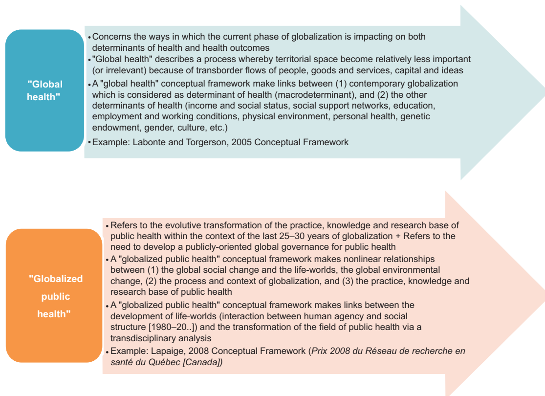
Figure 1 Today's era of globalization as a double-edge sword for public health: "Global health" versus "globalized public health."

The challenges of globalization related to the crisis in public health can be structured around four general themes (see Table 2). The first theme concerns collective resources and global public goods; the second theme relates to global governance; the third involves action by individual citizens and the fourth theme relates to the emergence of new inter-disciplinary fields of research.