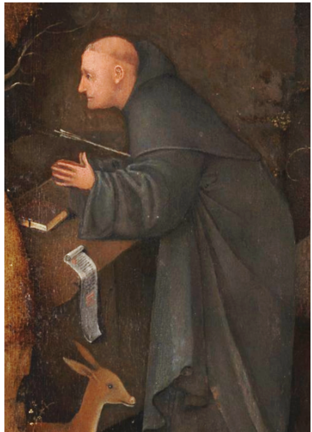
Figure 3 Detail of the right panel of The Triptych of the Hermit Saints by Hieronymus Bosch (1493), Gallerie dell'Accademia , Venice, Italy.

In the painting, The Triptych of the Hermit Saints (Figure 3), St. Jerome, St. Antony, and St. Giles are depicted on the 3 separate panels. All the 3 Saints are old men, a risk group for pneumococcal pneumonia. The Triptych is a painting of Hieronymus Bosch, one of the greatest Dutch painters. All of his paintings depict scenes beyond imagination, and even 600 years after his death, the debates on the interpretation of his works continues. Triptych of the Hermit Saints is on permanent display in the Gallerie dell'Accademia , Venice, Italy, but was brought to “s Hertogenbosch in 2016 on the occasion of Bosch” 600th anniversary. The center panel depicts St. Jerome kneeling in a desert-like landscape and surrounded by symbols of evil. In the left panel, St. Anthony, the