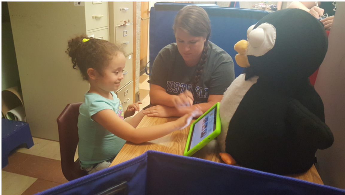
Figure 1 The PABI robot in a triadic therapy scenario providing DTT ABA therapy for an autistic child in conjunction with a therapist.