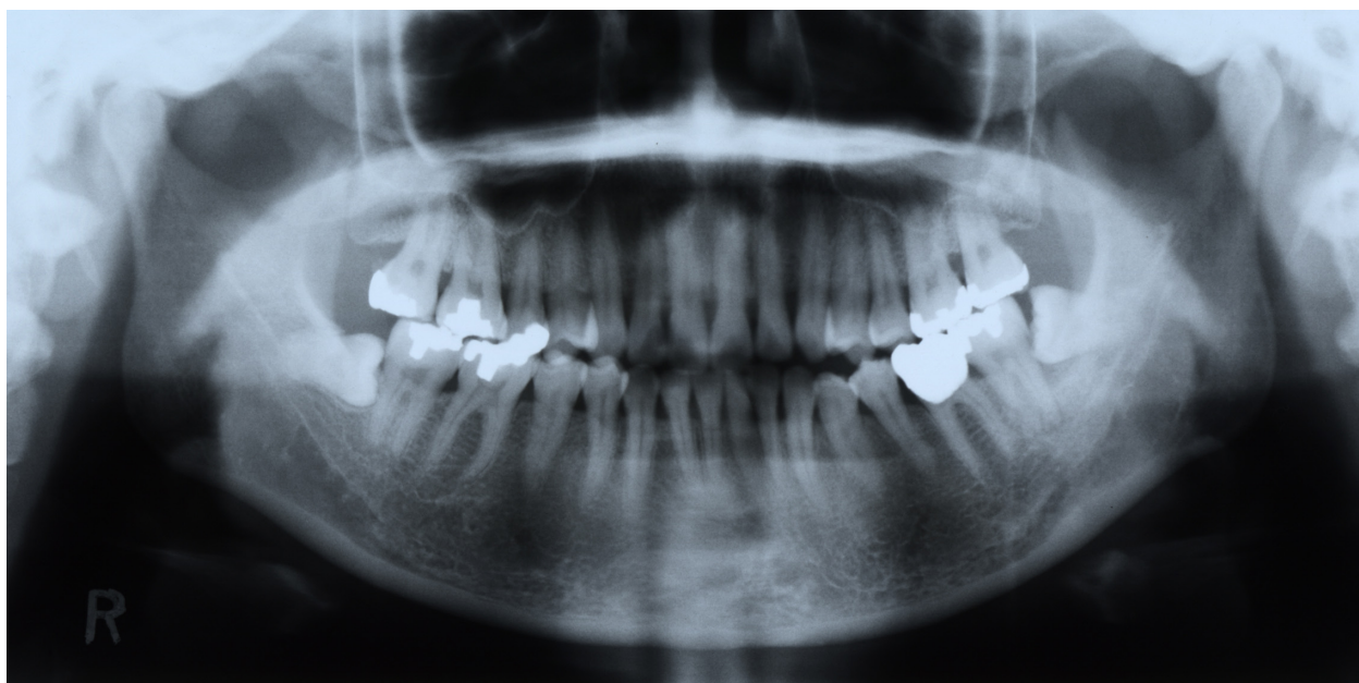
Figure 1 Right horizontal incompletely impacted third molar with lamina dura without radiolucency below the crown in a 38-year-old woman.

by a fully or partly uniform line as still present, even if the line was partly irregularly ruptured. Absence of the lamina dura was defined as no detection of a white line below the crown. On the other hand, the degree of bone resorption at the mesial surface of the canine and the first molar was assessed for aging or periodontal disease. Exposure of the root surface of the teeth was measured from the cemento-enamel junction to the alveolar crest at the mesial site of the teeth, and exposure of the root surface was calculated as a fraction of