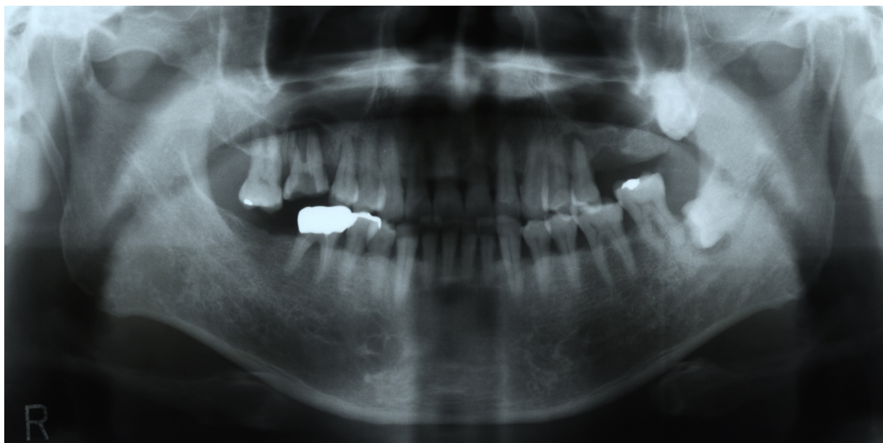
Figure 2 Left horizontal incompletely impacted third molar without lamina dura with radiolucency below the crown in a 51-year-old man.

the root length as determined radiographically. The mean \pm SD rate of bone resorption between the first and second measurements in the canine and first molar was calculated, with the mean \pm SD in those teeth in relation to the ipsilateral third molar, and grouped into categories with or without the lamina dura and the radiolucency below the crown of the third molar. Imperfect views of the root because of imbrication of individual roots due to curvature of the dental arch were excluded from the assessment. When assessment of