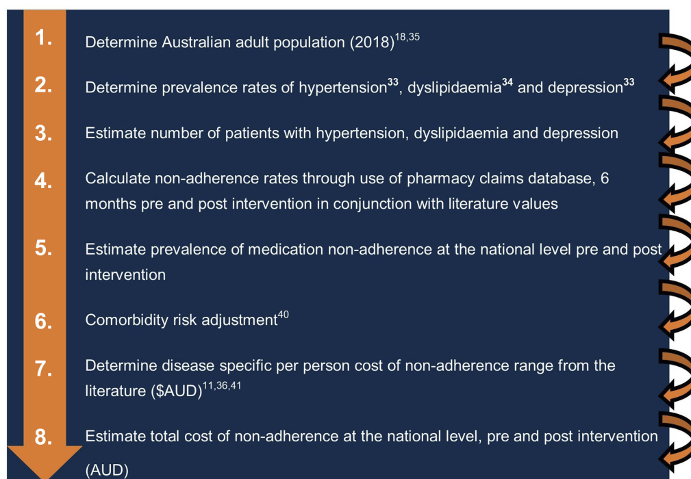
Figure 2 Derivation of the cost of medication non-adherence.

Monetary values attributed to medication non-adherence for hypertension, dyslipidemia and depression were identified from the literature. 11 All costs were converted to