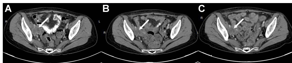
Figure 2 The CT scan of the cervical cancer patient.

In addition, to block the VEGF signaling pathway by working as TKI inhibitor, apatinib also inhibits the ABC (ATP-binding cassette) proteins which play critical roles in chemo-resistance. 17 It is well understood that ABC protein protects cancer cells by pumping out toxicity drug. In the preclinical study, concomitant treatment with paclitaxel, a most used toxicity drug, apatinib significantly increased the susceptibility to paclitaxel in either cervical cancer cells or the mouse model. 11 Cisplatin is the most effective single chemo-reagent for cervical cancer. Unfortunately, cisplatin treatment frequently results in the development of drug resistance after initial responses in various cancer. 18 Apatinib can restore the sensitivity of cancer cells to cisplatin by down-regulating the expression level of multi-drug resistance-1 and inhibiting the