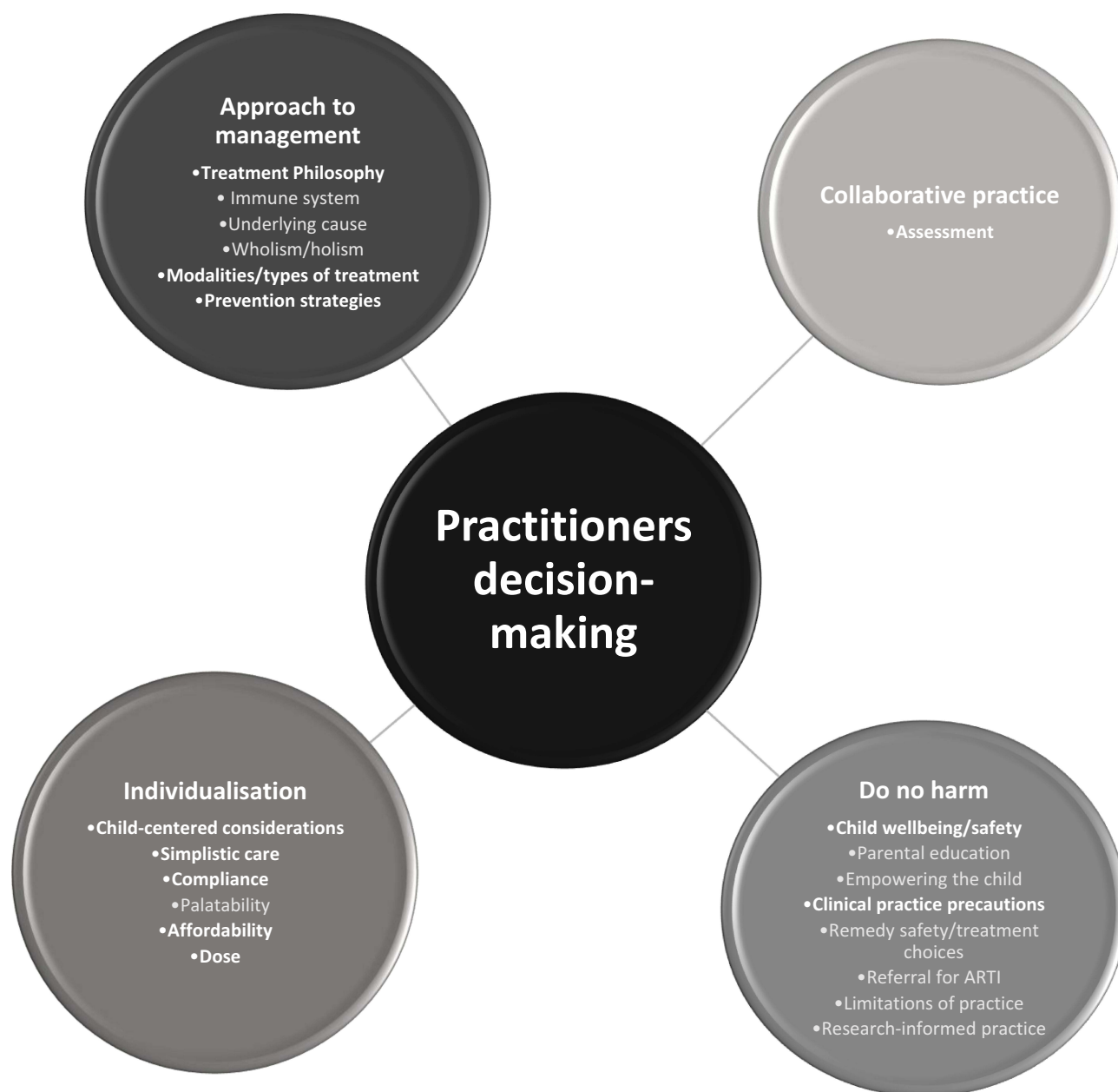
Figure 3 Diagrammatic overview of four key factors influencing practitioner decision-making regarding the management of ARTI in children.