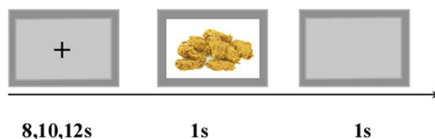
Figure 2 An example of a trial.

Three functional runs were carried out. Each run consisted of 40 trials. For each trial, a picture of low-caloric food (go trial, 75% occurrence) or a picture of high-caloric food (no-go trial, 25% occurrence) was presented for 1000 ms. Examples of go trials included pictures of broccoli, carrots, cabbage, and eggplants. Examples of no-go trials included pictures of chocolate cake, pie, and ice cream. Trials were separated by a fixation cross, which was presented for intervals ranging from 8 to 12 s to capture the full haemodynamic response (see Figure 2). Subjects were instructed to respond with a button press to low-caloric food but to withhold their responses to high-caloric food and to respond as quickly and accurately as possible. In the present study, E-Prime 2.0 as the software platform was used to present the stimulus. Reaction times were measured from the beginning of trial onset. Trials were presented in pseudo-randomized order, designed so that high-caloric food appeared with equal frequency after 1, 2, and 3 low-caloric food presentations. Subjects viewed stimuli through an adjustable mirror attached to the head coil. MRI acquisition was synchronized with the paradigm. In addition, different people have different appetite or eating habits; 39 therefore, the individualized food pictures were used in the present study to control this effect. Prior to scanning, all participants were required to rate the food pictures on the dimension of familiarity and