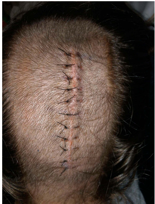
Figure 2 Pineal cyst resection – craniotomy incision.

An 18-year-old obese female with a body mass index of 33.4 and a history of irritable bowel syndrome (IBS) and severe gastroparesis presented to APMS during readmission for inability to tolerate oral intake following supracerebellar transtentorial resection of 10 cm pineal cyst. Patient's incision is shown in Figure 2. She had been discharged home on postoperative day (POD) two and readmitted for severe headache, nausea, vomiting, and constipation on POD three. The headache was primarily localized to the frontal region with associated photophobia. Neurologic exam was nonfocal, and imaging of the head revealed expected postoperative changes. She was started on acetazolamide 500 mg BID, dexamethasone 10 mg intravenously followed by 4 mg