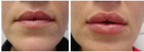
Figure 4 Before (left) and one month after (right) the treatment of upper and lower lips with 2 mL of cross-linked CMC.

had to add it to other synthetic substances. Here are two examples: