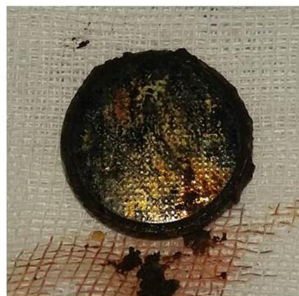
Figure 1 Foreign body in the oesophagus (battery).

Notes: Reproduced with permission from Dörterler. 7530