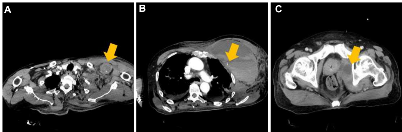
Figure 2 Chest computed tomography (CT). CT showing multiple hematomas, including a chest wall hematoma with active extravasation (A, B) and an obturatorius internus muscle hematoma (C). The arrow indicates extravasation.

Coagulopathy is a common feature in patients with COVID-19. The pathogenesis of COVID-19-induced coagulopathy has not yet been fully elucidated, but the mechanisms may overlap with those of sepsis-associated