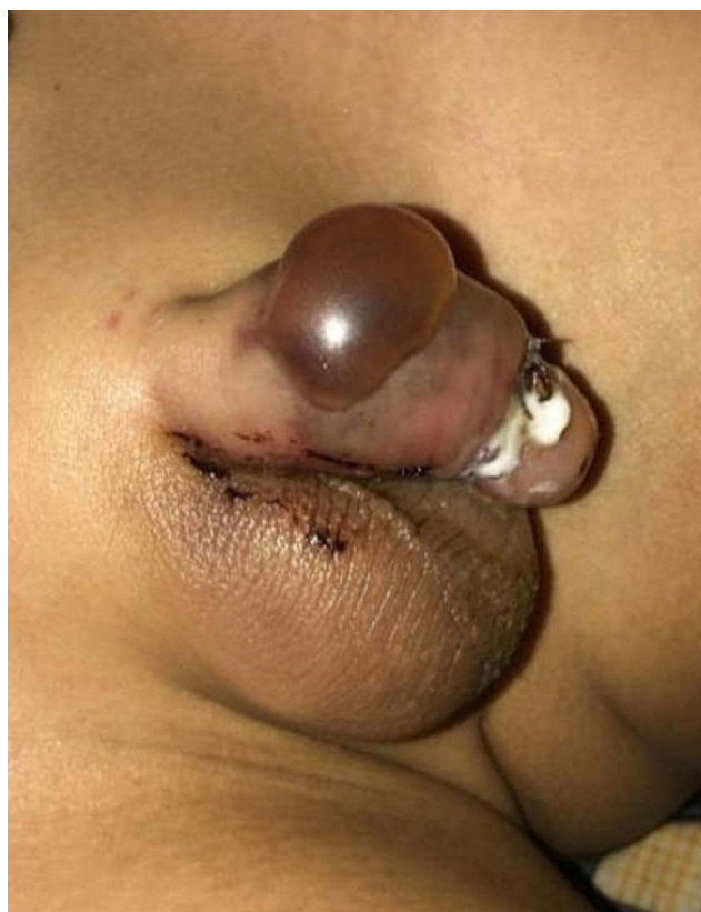
Figure 1 The blister appeared on the penile corpus 24 h after the circumcision.

with normal saline compress and wound crust cleansing was performed. On the second day after the circumcision, the blister had subdued, and the superficial ulcer was observed at the wound bed. On the third day, yellowish-necrotic tissue was observed on the lateral side of the glans (Figure 2). Neither gangrene nor pus was observed at the penis. One week after the circumcision, the wound at the glans and corpus was improved. Four months after the circumcision event, the penis had healed without any cicatrix (Figure 3). There was no disturbance in micturition or erection.