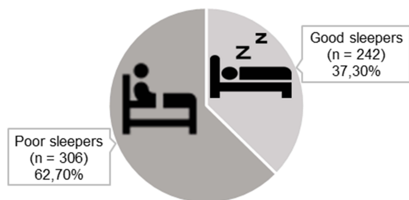
Figure 2 Percentages of poor sleepers and good sleepers during the T1 and the T2 assessments.

Notes: A Sleep Index II score >25.8 was categorized as Poor sleeper; A Sleep Index II score <25.8 was categorized as Good sleeper. The icons are selected from the https://icons8.com/icon/105962/subire-l'insonnia and https://icons8.com/icon/10787/dormire-nel-letto .