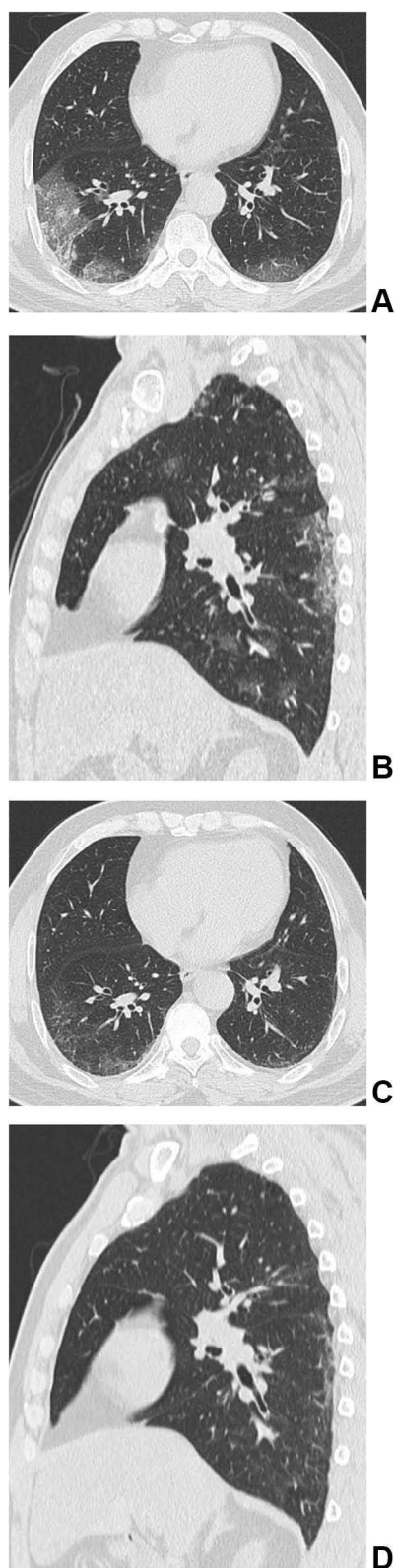
Figure 2 (A–D) Male, older patient with COVID-19. The initial CT at the hospital ( A and B ). The axial initial CT ( A ) shows the patchy ground-glass opacities (GGOs), crazy-paving pattern, and a few of consolidation under the subpleural area of the both lower lobes. The sagittal initial CT ( B ) shows the patchy GGOs under the subpleural area of the right upper lobe and the right lower lobe. The follow-up CT obtained after 451 days ( C and D ). The axial follow-up CT ( C ) and the sagittal follow-up CT ( D ) show reticular patterns, irregular linear opacities and a few of GGOs remain under the subpleural area of the both lower lobes ( C ) and the right lower lobe ( D ).