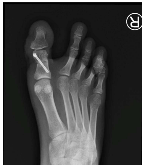
Figure 4 Post operative result depicting 8.93° interphalangeal joint angle.

This case report was registered and approved by the institutional review board of Hasan Sadikin Hospital, Bandung, Indonesia, No. LB.02.02/X.6.5/479/2022. The patient provided informed consent to publish their case details and any accompanying images.