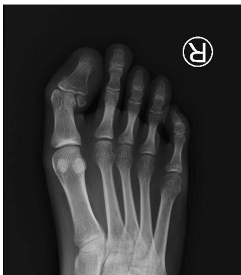
Figure 2 Lateral deviation of great toe interphalangeal joint as much as 28.69^\circ with the presence of an ossicle in lateral side.