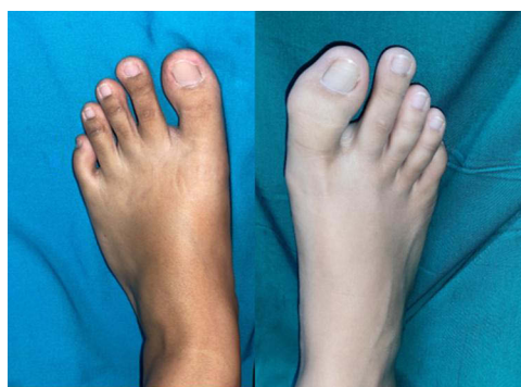
Figure 1 Hallux valgus interphalangeal deformity.

Surgical correction was done using Akin osteotomy and ossicle excision (Figure 3). The patient was operated under regional anesthesia in the supine position. Longitudinal incision was made on the medial side, deepened through the joint capsule to expose the osteotomy site. The guide wire was placed under an image intensifier visualization prior to the osteotomy. Medial closing wedge osteotomy was performed and fixed by a 3.2-mm diameter headless dual compression cannulated screw (Normed Medizin-Technik GmbH, Germany). After osteotomy, the ossicle and covering bursa at the lateral side was removed. Lateral capsule release and medial capsule imbrication were subsequently performed. Post-operative standard dressing was applied with particular spacing between the great toe and second toe. The patient was allowed to partially bear weight using a post-operative rocker bottom footwear. The post-operative interphalangeal joint angle was 8.93^\circ (Figure 4). The surgical wound healed uneventfully.