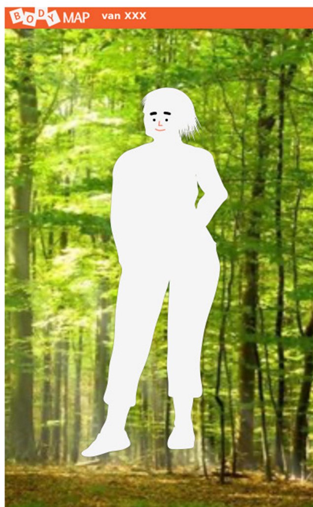
Figure 1 Basis of a body map. Text on top reads: “Body map of XXX”.

Young people (16 to 25 years) who undergo treatment for a chronic, somatic condition were invited to participate. They were recruited using an recruitment call placed on the website of JongPIT, a Dutch foundation for and led by young people with a chronic condition. In total, ten young people participated in this study (Table 1). They had different chronic conditions, such as diabetes, rheumatism, cerebral palsy and scoliosis.