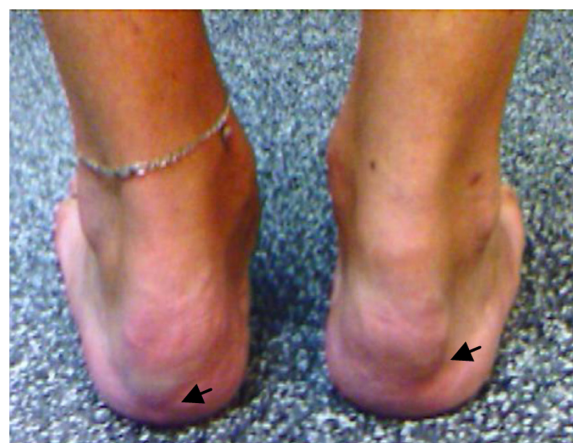
Figure 2 Enthesitis of the Achilles tendon.

Note: Arrows indicate severe inflammation of the Achilles tendon (enthesitis).