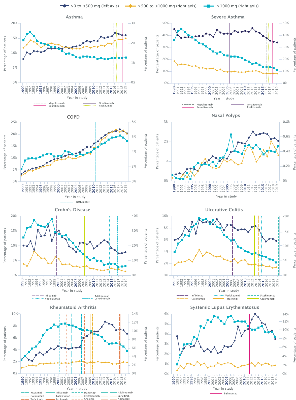
Figure 1 Total yearly SGC dose by category. Percentage of patients per analysis year for asthma, severe asthma, COPD, nasal polyps, Crohn's disease, ulcerative colitis, rheumatoid arthritis, and systemic lupus erythematosus. European Medicines Agency approval dates for biologic therapies are marked by vertical lines. In order to minimize the misattribution of an SGC indication, only one condition per patient per year for which an SGC could have been prescribed was used for these analyses. Abbreviations: COPD, chronic obstructive pulmonary disease; SGC, systemic glucocorticoid.