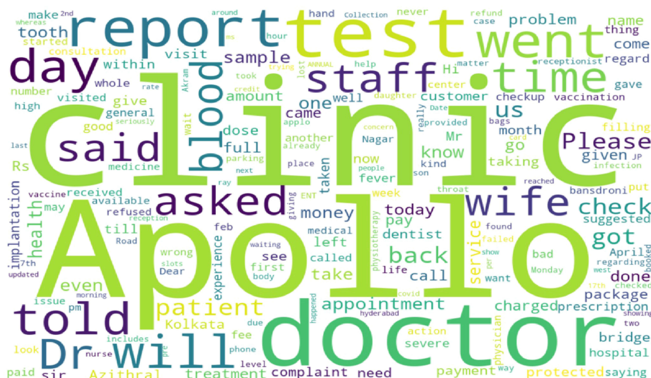
Figure 2 Word cloud generated from complaint text.

of the consumers towards the particular diagnostic centre negatively. Geographically, customers from JP Nagar and Salt Lake reported the highest frequency of unfavorable experiences. Healthcare marketing policymakers should prioritize recruiting frontline staff with strong interpersonal skills and expertise to create a memorable customer service experience. 68 This study contributes to the existing body of knowledge in customer experience by examining unfavorable customer experiences in diagnostic centers, as reflected in customer complaints. The findings have managerial, policy, and theoretical implications.