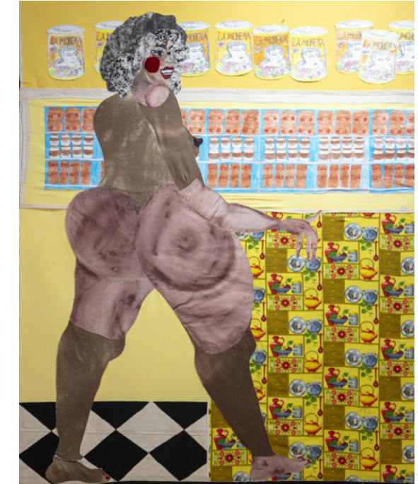
Ol' Bay, 2019, painted canvas, fabric, digital rendering on canvas, hand colored photocopy, photocopy, paper, Flashe, gouache and acrylic on canvas, 96 × 84"