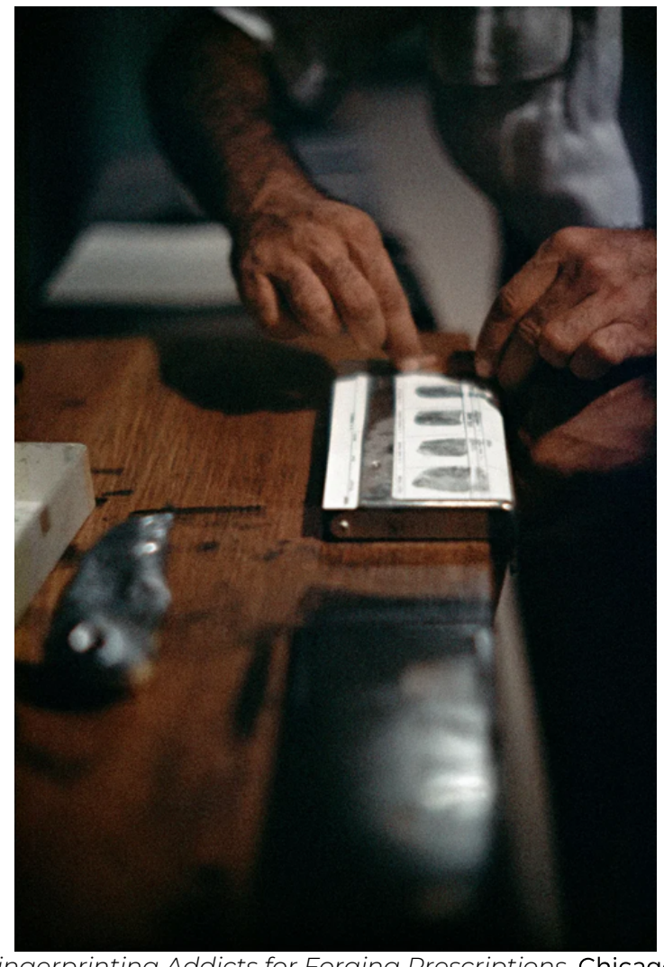
Fingerprinting Addicts for Forging Prescriptions, Chicago,

Cooked white rice or coconut rice, for serving (see note) Lime wedges, for serving Mango chutney or mango pickle, for serving Fresh cilantro leaves, for serving