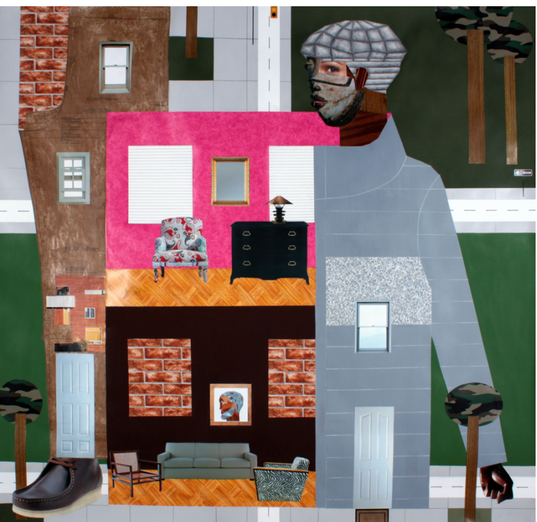
Derrick Adams, Walkthrough, 2014, Mixed media collage on paper, 50 x 50 inches.

Derrick Adams destabilizes cultural understanding of urban and identity politics through performance, collage, sculpture, and installation. For Borough, his first solo exhibition with Rhona Hoffman Gallery, Adams presents a sculpture and seven new mixed media collages that visually rupture lines between human figures and domestic architectural spaces