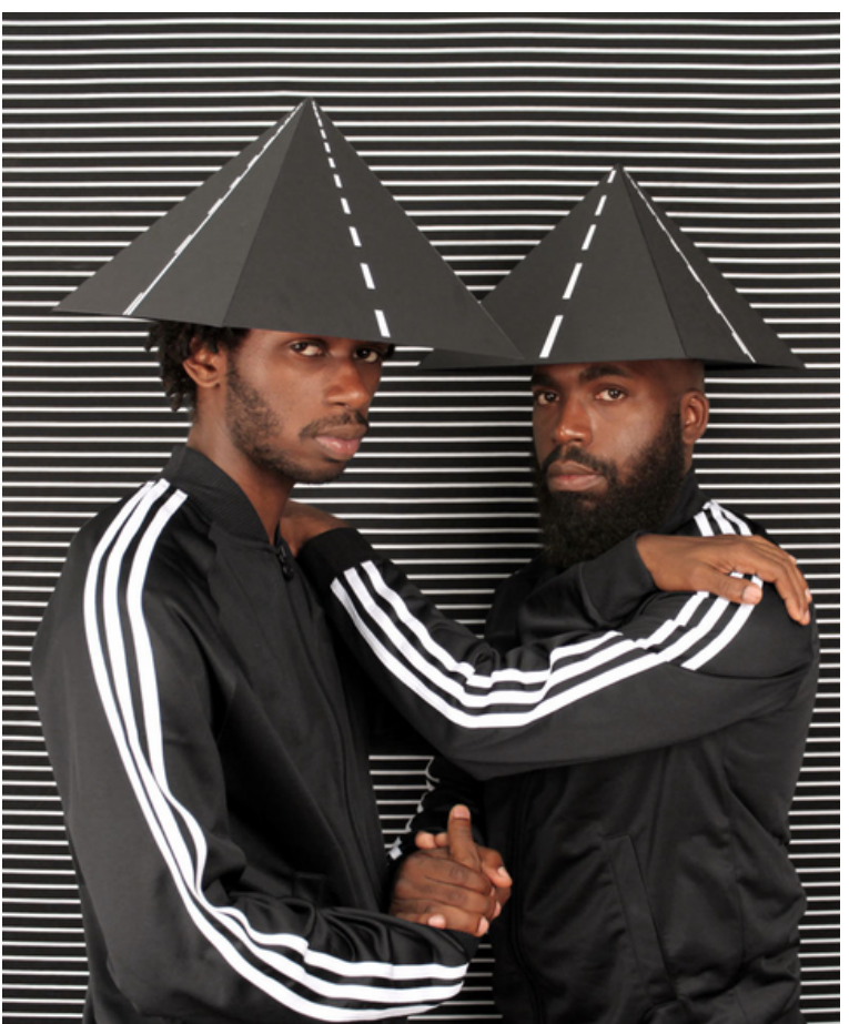
Crossroads. 2012.(Digital photograph) 44 in. x 36 in. Edition of 3 + 2 APs.