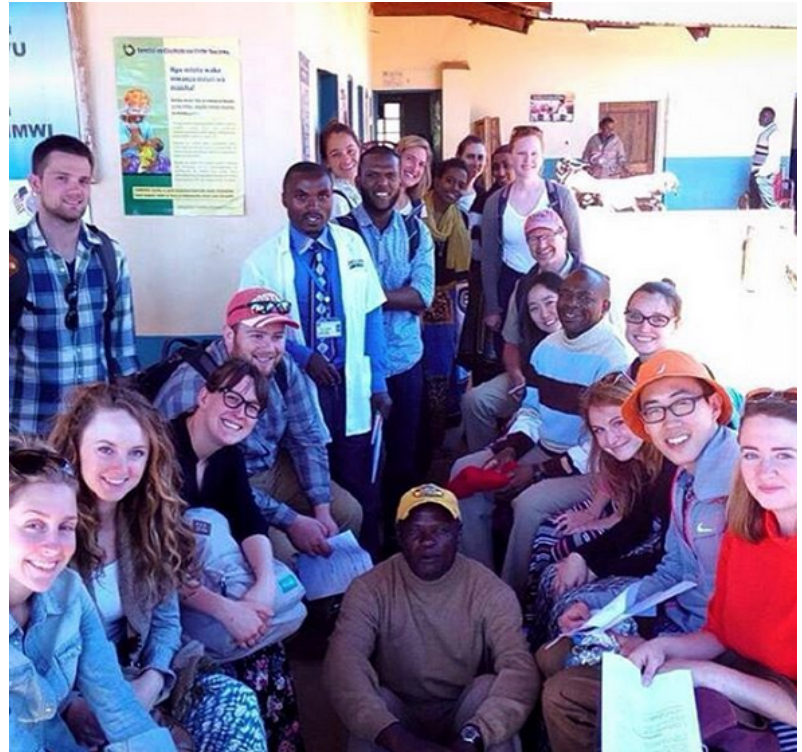
TANZANIA SPH TEAM ON THE GROUND. FOLLOW THEIR ADVENTURE AT INSTAGRAM.COM/BUSPH