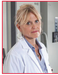
Dr. Ann McKee, M.D.

For more information about participating in research and about CTE in general, please visit https://www.bu.edu/cte/ .