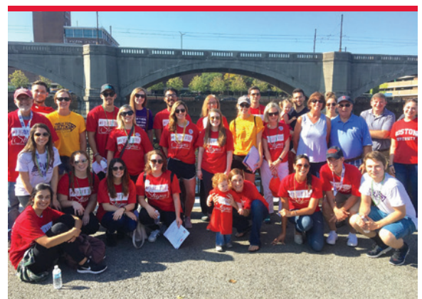
The BU ADC team supported the Alzheimer's Association at the Greater Boston Walk to End Alzheimer's in Cambridge.

our partners at Senior Living Residences' Boston communities to help raise awareness and funds towards Alzheimer's research and supportive/educational services. The BU ADC staff and faculty raised $5,992.25 .