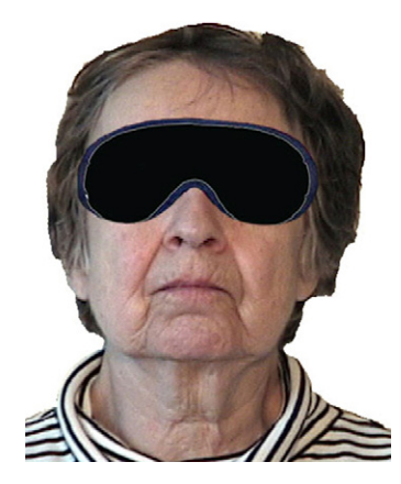
Fig. 3. Masked face stimulus.