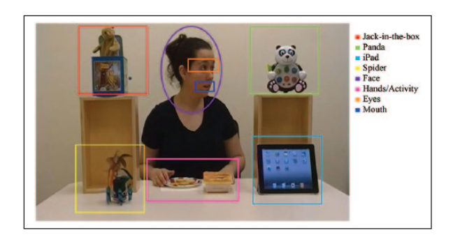
Figure 1. Composition of the scene—snapshot from episode 5.

gaze-shift episodes the young woman also turns her head, not just the eyes, toward the object of her attentional focus, so there is no ambiguity about her direction of gaze for the viewer watching her behavior. The total duration of the video is 75 s, and the duration of each episode is listed in Table 3.