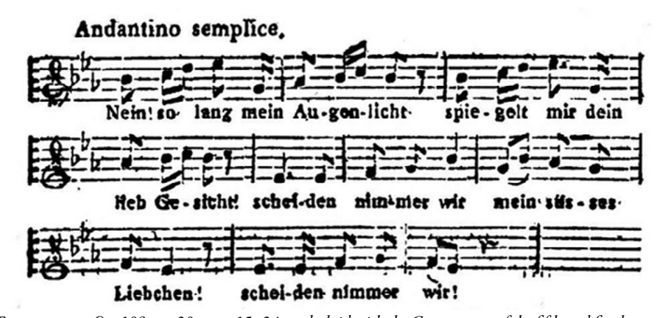
FIGURE 12. Op. 108, no. 20, mm. 15–24, underlaid with the German text of the fifth and final verse