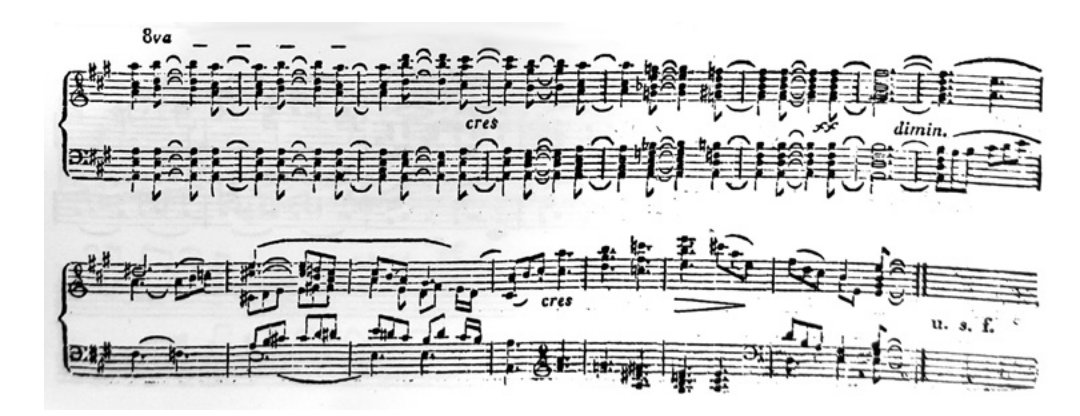
FIGURE 3. Op. 101, 1st movement, mm. 81–95

Just as interesting is the harmonic progression by which the composer leads to the conclusion: