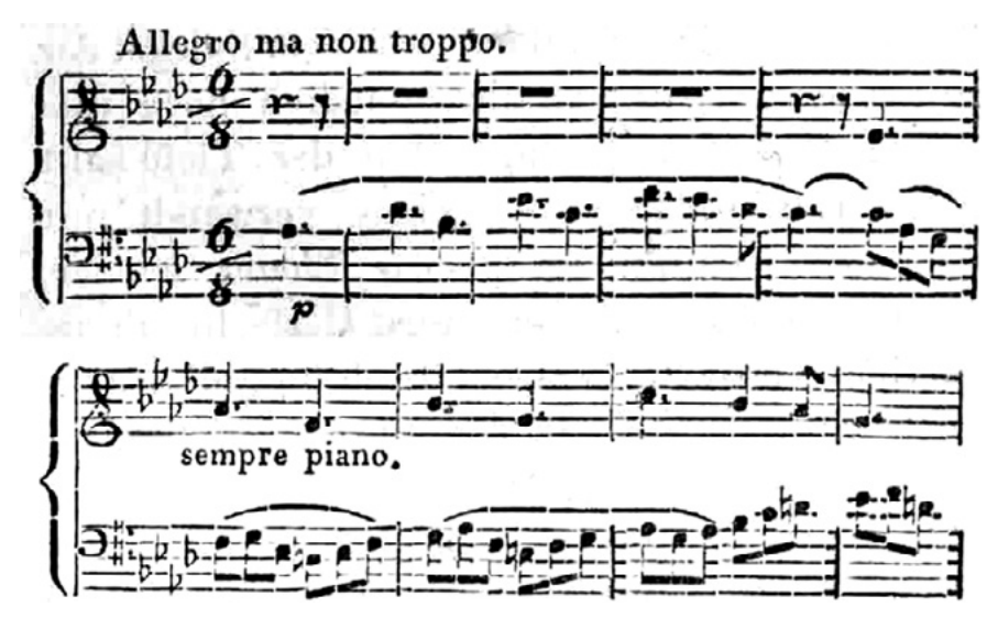
FIGURE 25. Op. 101, 3rd movement, mm. 27–35

Let us consider once again the theme, along with the countersubject that is joined to it, "