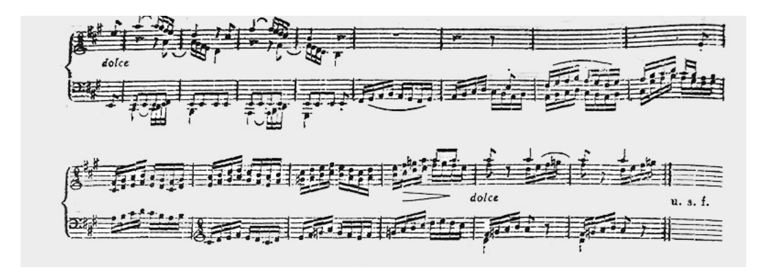
FIGURE 9. Op. 101, 4th movement, mm. 238 (with upbeat)–53

Then the beautiful treatment of the theme at the return to the maggiore :