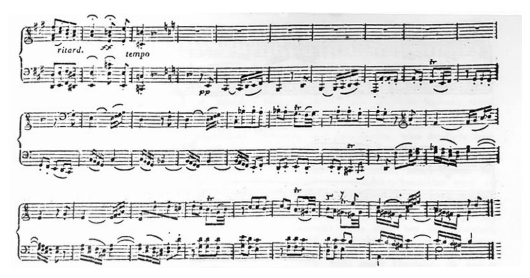
FIGURE 7. Op. 101, 4th movement, mm. 120-47

In order to develop all the beauties of this admirable piece, one would have to copy it in its entirety. It emerges, so to speak, from one integrated whole, neither too much nor too little; it consists of only a pair of principal ideas, but these are used completely exhaustively, decked out with all the arts of counterpoint that stand at the command of the genuine master, and thoroughly and strictly worked out with a certainty that vouches for study of the old classicists. Our readers will certainly pardon us if we cannot resist the temptation to cite at least several examples as proof of our assertion. See how the composer arranges his second part: