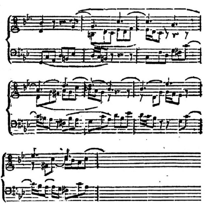
FIGURE 26. Op. 101, 3rd movement, mm. 152–58

As the fugue advanced in straightforward motion, with the character of inflexible strictness, with the theme beginning in the bass, appearing there again after the first exposition and then twice again in octaves: so does the upper voice begin here with the theme in inversion, with the most eloquent expression of timid, humble resignation. And how does the childlike G major support this expression! In place of the countersubject the theme appears worked through twice in diminution in two voices with an accelerated, ephemeral closing formula that disrupts the character