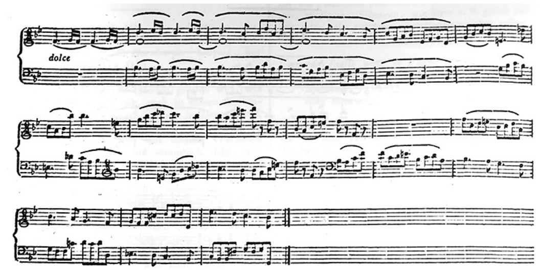
FIGURE 4. Op. 101, 2nd movement, mm. 55–69<sup>3</sup>

The following passage may find a place here as well: