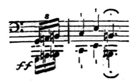
FIGURE 19. Op. 111, 1st movement, mm. 19–20. The key signature of three flats is missing.

something powerful, to a pause on the dominant, with which the Allegro section begins. The principal idea of this section actually consists of only three notes: