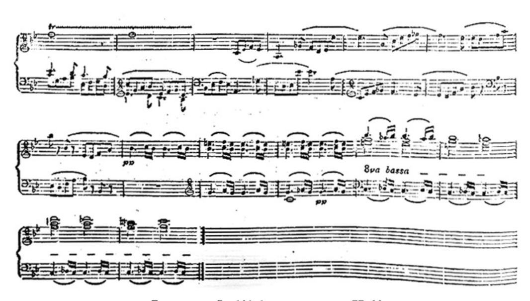
FIGURE 5. Op. 101, 1st movement, mm. 77–90

The following passage may find a place here as well: