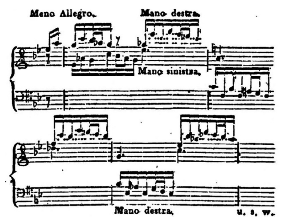
FIGURE 27. Op. 101, 3rd movement, mm. 168–172

against the principal theme proclaimed in the upper voice in orderly motion and in augmentation. Immediately thereafter it is repeated by the bass in octaves with the greatest majesty.<sup>16</sup> Ties then appear simultaneously in all voices,<sup>17</sup> the pulse falters, the motion is arrested, until a gentle play with notes begins with a twice diminished and shortened theme,