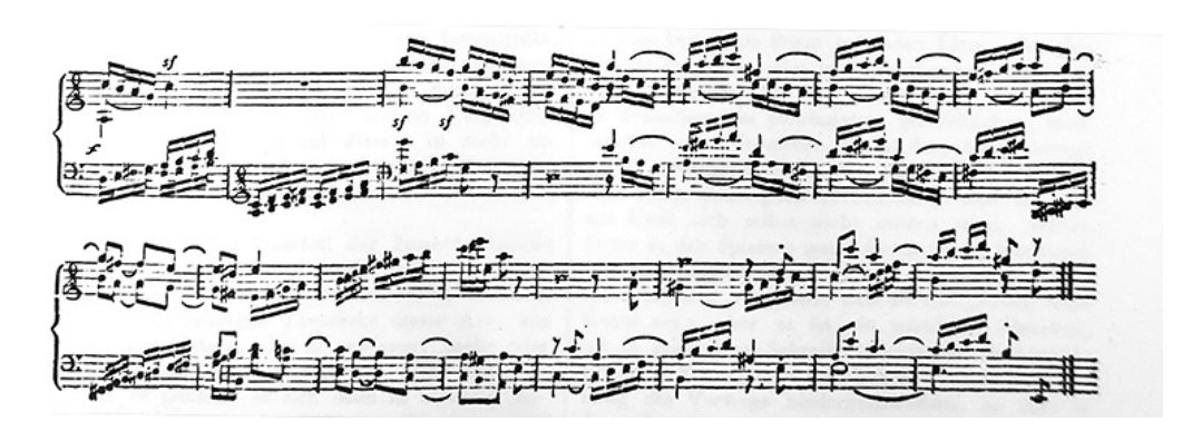
FIGURE 8. Op. 101, 4th movement, mm. 198–212

Then the beautiful treatment of the theme at the return to the maggiore :