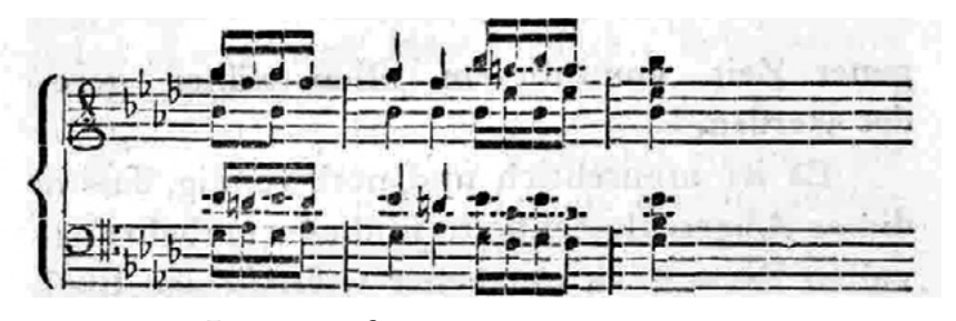
FIGURE 22. Op. 101, 1st movement, mm. 23-25

develop with the most natural facility, which is the surest mark of genius.