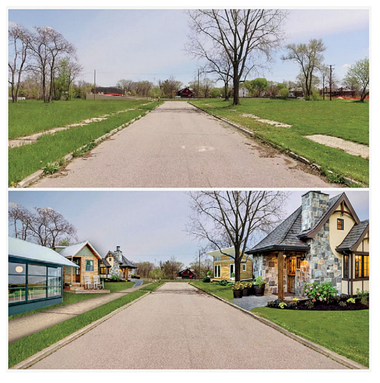
Cass Community Social Services plans to build 25 unique tiny homes in a blighted northwest Detroit neighborhood in the next five years; six are already built and six are under construction.