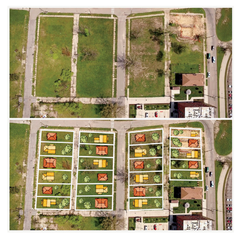
The first homes built accommodate one or possibly two people comfortably in no more than 400 square feet of space. Tiny house occupants must be residents of Michigan and must earn at least $8,000 a year.

30 feet by 100 feet. Fowler raised the money from private sources, foundations, and donors, including $400,000 from the Ford Fund, to pay for materials. She says the agency has enough funds to build 19 of the 25 planned houses, each costing $40,000 to $50,000 and taking about four months to build.