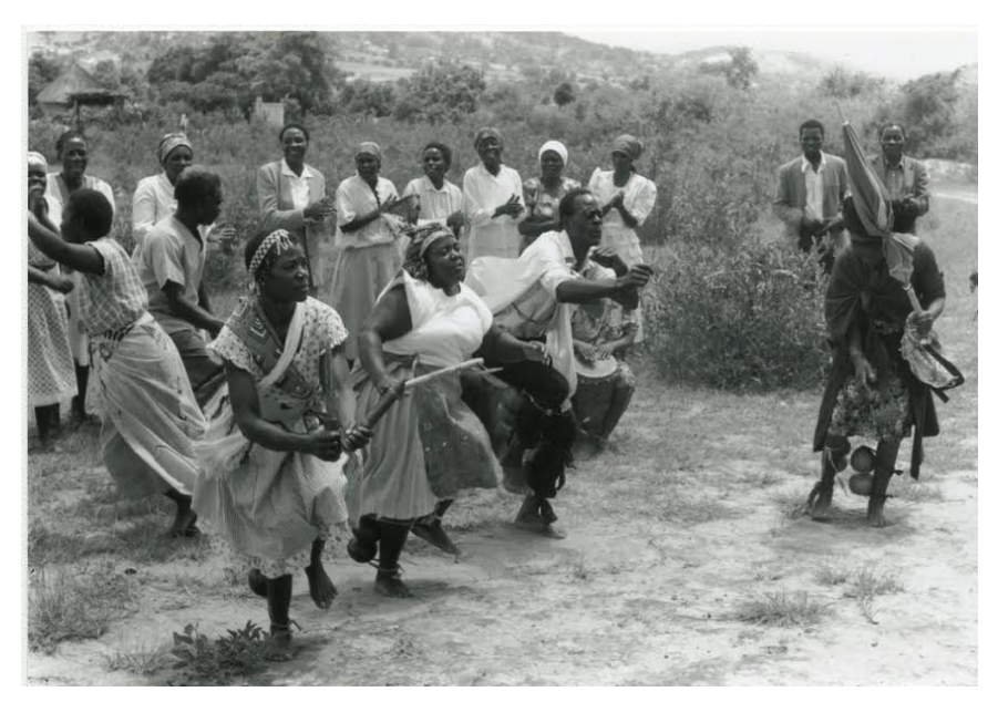
AIC members in Zimbabwe dance as a form of worship. This photo and many others will be included in the upcoming AIC Photo Archive.

As a guiding theme for this academic year, the Center for Global Christianity and Missions has asked the following question: what is world Christianity? On our website and in our last issue, scholars associated with the CGCM provided a wide array of thought provoking answers to our thematic question. While we began the year thinking at the global level, we now set our sights on decidedly more local aspects of the bigger picture. This semester, the CGCM will be enthusiastically hosting the Global Christianity Speakers Series that will include academics who study specific topics in world Christianity—ranging from Orthodoxy, Roman