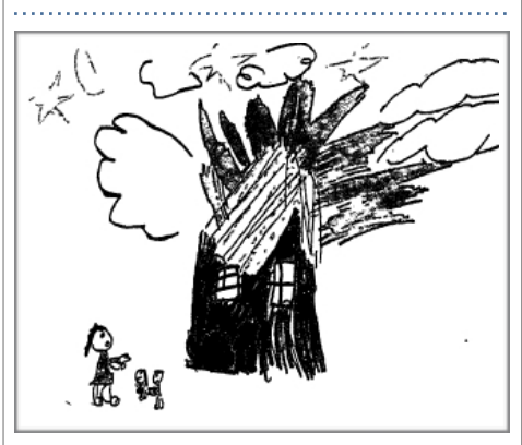
"A Storybook of Civil War," Northeast , May 31, 1987. Child's drawing of home burned by Guatemalan soldiers.

In the 1980s, New England became an important node in the Sanctuary Movement. Churches and synagogues moved families from El Salvador and Guatemala to the area not only to provide them safety, but also that the refugees might act as witnesses to the brutality and injustice of US-sponsored dictators. Often living in the basements of local houses of worship, these "missionaries," as they were sometimes called, were specially selected and prepared for the arduous task of converting the American political imagination. With support from congregations, asylumseekers addressed a variety of audiences about the human toll of the Cold War. Under the direction of Rady Roldan-Figueroa, the Center for Global Christianity & Mission is documenting and analyzing the regional networks that collaborated in the Sanctuary Movement. Findings will be made available in both print and digital formats. The Sanctuary Movement was one way mainline congregations reimagined mission in the post-colonial age.